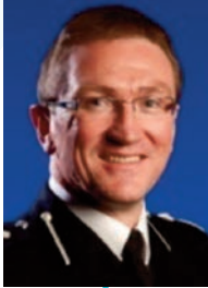
CC IAN HOPKINS